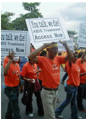
Demonstrators question the conference slogan "Access for All", at the start of AIDS 2004