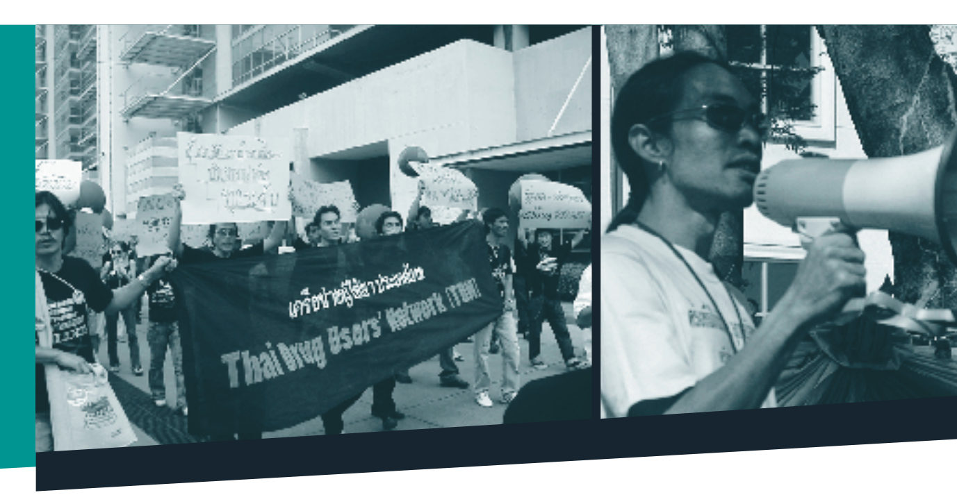
Thai Drug Users' Network Protest in Bangkok, Thailand.