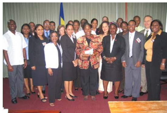
CARICOM delegation, February 2006

Tobago) to devise recommendations and commit to personal action. Recommendations recognized the potential for greater involvement of the University of the West Indies' law faculty in the legal community's response to HIV/AIDS.