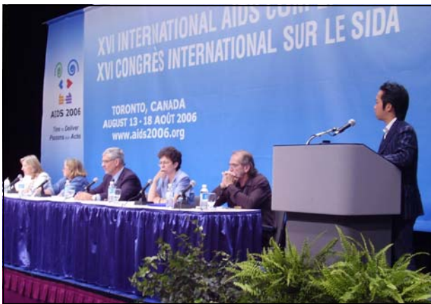
The Legal Network's press conference at AIDS 2006

For more information on the Legal Network's media activities, visit www.aidslaw.ca/media .