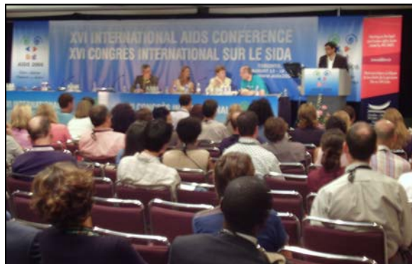
The Legal Network / MSF panel discussion at AIDS 2006