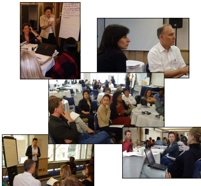
Participants at the Legal Network's pre-AIDS 2006 symposium

The symposium was supported by the Health and Law Program of the Open Society Institute, UNAIDS, the UN Development Programme, and the Canadian International Development Agency.