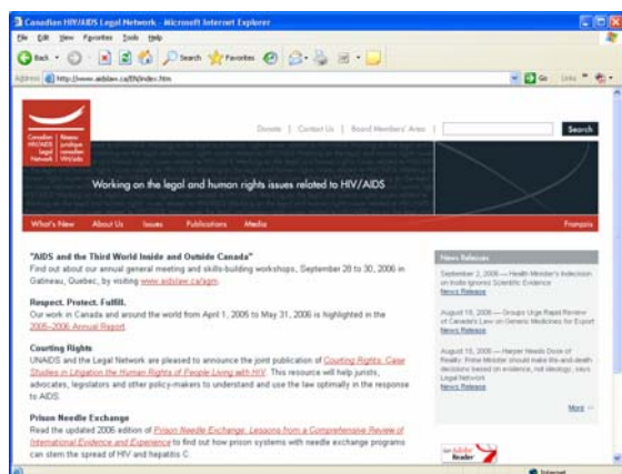
The home page of the Legal Network’s redesigned website

We invite you to visit our new on-line presence at www.aidslaw.ca . Please share your thoughts on the redesigned website with us by sending an e-mail to info@aidslaw.ca . Your feedback will help us to further improve our website to serve you better.