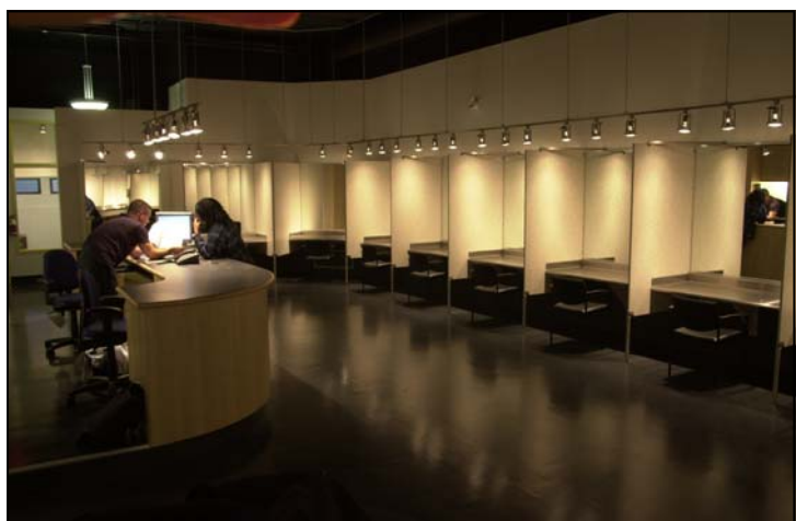
Insite, Vancouver

The Legal Network and three other national HIV/AIDS NGOs reacted in a September 2 news release, decrying the federal government's "indecision" and exhorting it to live up to its responsibility to prevent HIV rather than "blatantly disregarding evidence in favour of ideology." The Legal Network will continue to advocate not only for the continued existence, but also the expansion, of harm reduction services for people who use drugs.