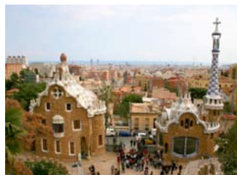
Barcelona, host city of "Harm Reduction 2008: IHRA's 19th International Conference"