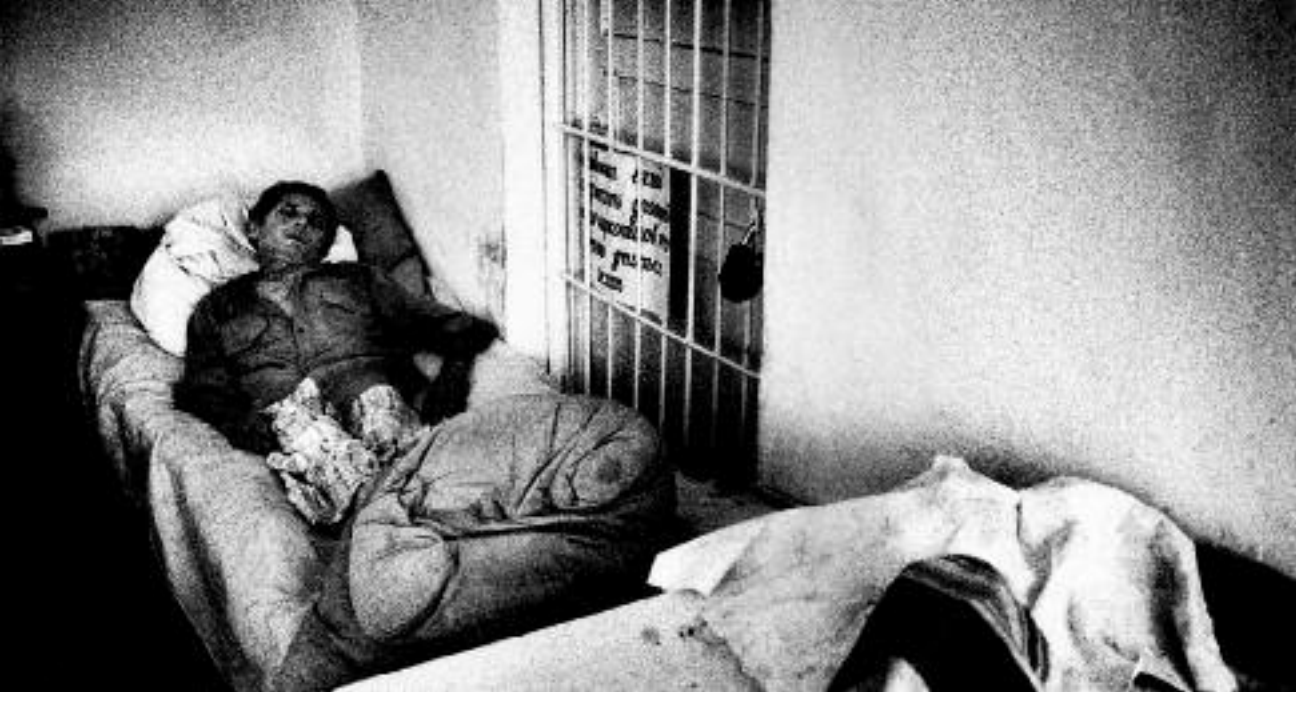
A man suffers through unmedicated withdrawal in a narcological clinic in Dushanbe, Tajikistan.