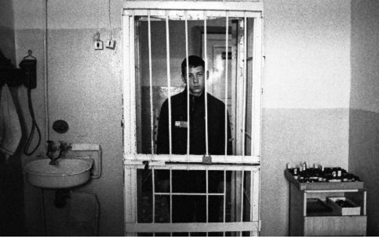
A prisoner with tuberculosis in Tomsk, Russia waits to receive medication at a local prison hospital. HIV and TB are common infections among drug users in Russia's prisons.

The Collective Security Treaty Organization (CSTO) is a political and military organization of seven former Soviet Union countries, established in 2002 on the basis of the 1992 CIS Collective Security Treaty, with counteracting drug trafficking as one of its goals.<sup>195</sup> In 2003, the CSTO adopted a decision "On strengthening measures to combat drug dependence and drug trafficking as financial basis of transnational organized crime."<sup>196</sup> According to a Kazakh parliamentarian, recommendations on unifying and harmonizing the legislation of CSTO member states in combating international terrorism and drug trafficking have been used to toughen the drug law of Kazakhstan.<sup>197</sup> More recently, in March 2008, there was a meeting of the coordination council of the heads of the national drug control agencies (within the framework of the CSTO)<sup>198</sup>, with the main goal of pursuing unification of legislation in the area of drug control.<sup>199</sup> The coordination council was created in 2004 to fight "narco-expansion" in the region, and has since coordinated a number of high-profile border control anti-trafficking operations in the region. The coordination council is currently chaired by the former Director of the Russian Federal Service on Control over Drugs Circulation.<sup>200</sup>