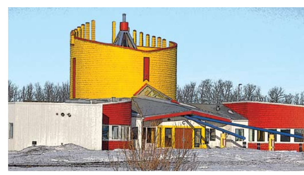
Pê Sâkâstêw Centre (Maskwacis, Alberta)

You have rights in segregation. You must be allowed access to spiritual support, including Indigenous Elders, and to health care and mental health services. You must also be allowed access to personal cell effects, such as your medicine bundle and smudging kit, within 5 working days of moving to segregation. <sup>14</sup>