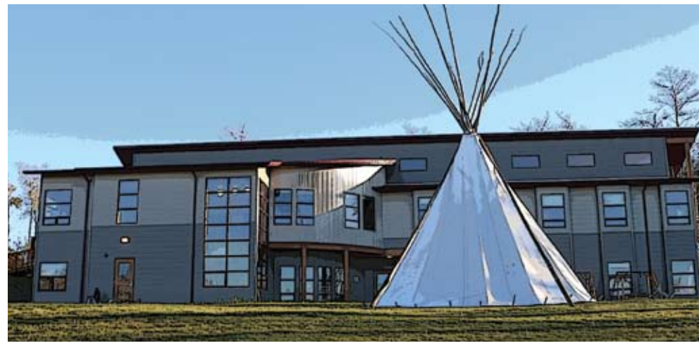
Okimaw Ohci Healing Lodge (Maple Creek, Saskatchewan)

An Aboriginal Women Offender Self-Management Program may also be offered in an institution or the community. It targets women who need support to maintain skills they have learned in other programs. The program involves Indigenous Elders and consists of 12 sessions that are each 2 hours long.