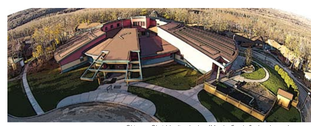
Okimaw Ohci Healing Lodge (Maple Creek, Saskatchewan)

Among other reasons for non-disclosure, federal prisons may refuse to disclose information if seeing this information would affect your physical and mental health and would not be in your best interest (but we are not aware of examples of this having happened).<sup>5</sup> If access is refused, it may be because the information does not exist. If the information does exist and access is refused, you should be told on what grounds access was refused.<sup>6</sup> If you disagree with a decision to refuse access to your health records, you could file a complaint with the Privacy Commissioner (see contact details above).